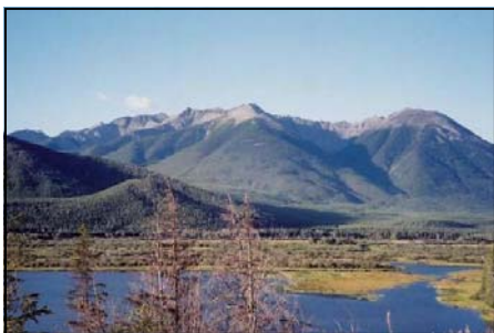
Wyoming’s Big Horn Mountains will serve as the backdrop for a Catholic Youth Summer Adventure.

mer activities but they are all part of the exciting Wyoming Adventure of Prayer and Service scheduled June 16-22, 2007, at the San Benito Monastery in Dayton, Wyo.